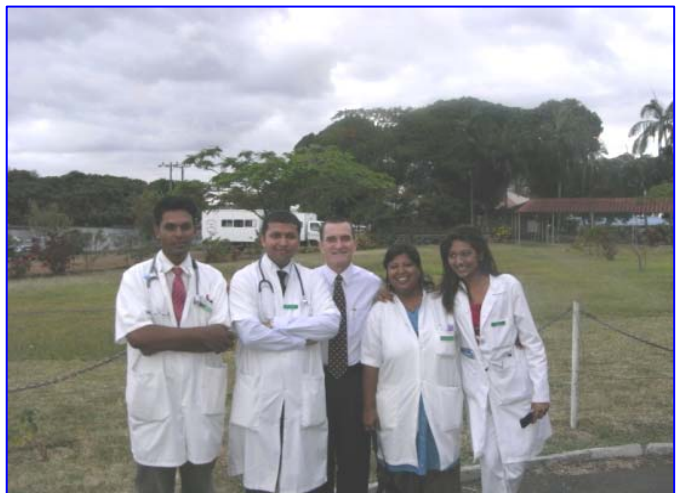
"Daring Young Dodos" is a poem about the junior doctors in this photo.